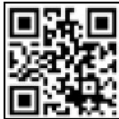
Photo Session Dates

To schedule your photography appointment online, visit www.ucdir.com , click the "Photography Appointment Scheduling" link on the right side. For Church Code , enter 1L378 , and for Church Password enter photos . Follow the prompts to schedule your family's appointment time. If you have 6 or more in your family, please use 2 consecutive time slots. The on-line scheduling option is available Monday through Friday. Appointments fill up quickly, so schedule as soon as possible to secure your preferred date and time.