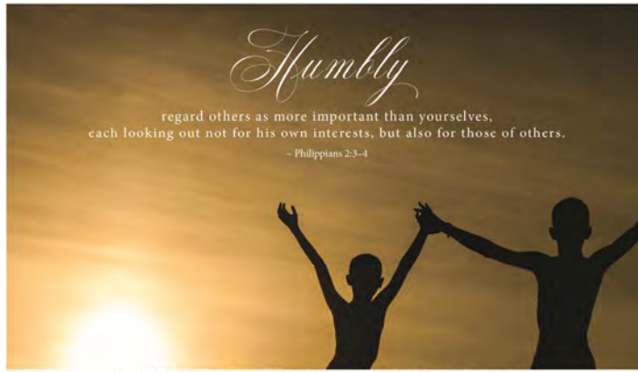
Copyright © J.S. Palach Co., Inc. Excerpts from the Lectionary for Mass © 2001, 1998, 1997, 1986, 1970, CCD.

May perpetual light shine upon them. May they rest in peace.