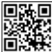
Photo Session Dates

Follow the prompts to schedule your family's appointment time. If you have 6 or more in your family, please use 2 consecutive time slots. The on-line scheduling option is available Monday through Friday. Appointments fill up quickly, so schedule as soon as possible to secure your preferred date and time.